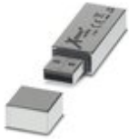
USB memory stick, 8 GB

USB memory stick - USB FLASH DRIVE - 2402809